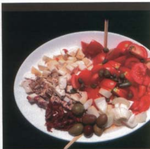
Above Photos: A selection Of typical Maltese Dishes

Traditional sweets include the honey rings (qaghaq tal-ghasel) at Christmas, 'Figolli' at Easter and the 'Prinjolata' during Carnival.