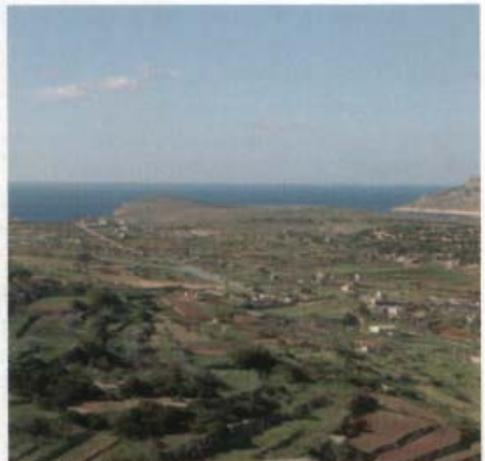
Above left: A farm Valley at Mellieha Above right: Farms overlooking Mellieha Bay and Anchor Bay

However farming remains in the heart of many people who still work the fields, although the majority do so on a part-time basis. The fields were constructed by our forefathers who converted bare land into beautiful and large stretches of soil bordered by rubble walls. Those who are still engaged in farming as their main source of living have kept abreast with progress and adopted professional methods and modern equipment for their trade.